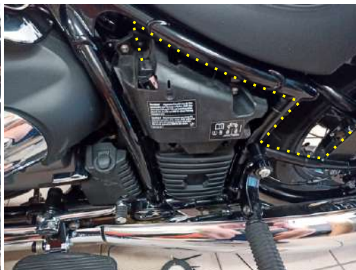
cable installation Right and Left side

gently by hand bend the lower round bracket from the saddlebags down so that there is approx. 10 mm of space between the unattached saddlebags and the bracket ,then tighten the screw to the end so that Saddlebags do not shake.