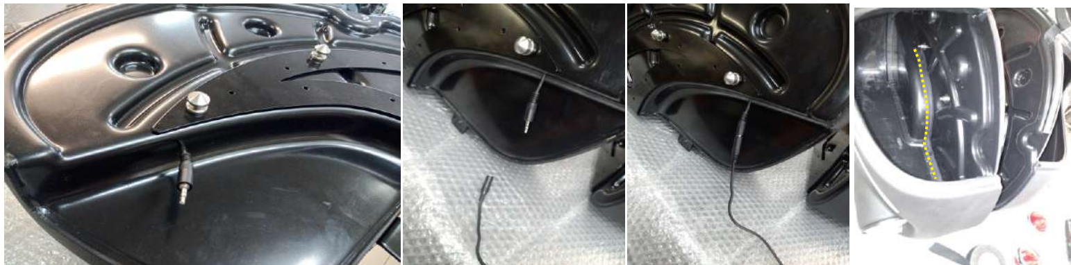
the cable with the male socket is routed along the inner edge of the Saddlebags and fix cable with self-adhesive cotton tape

I suggest you a simple solution to connect additional lights on the Saddle bags