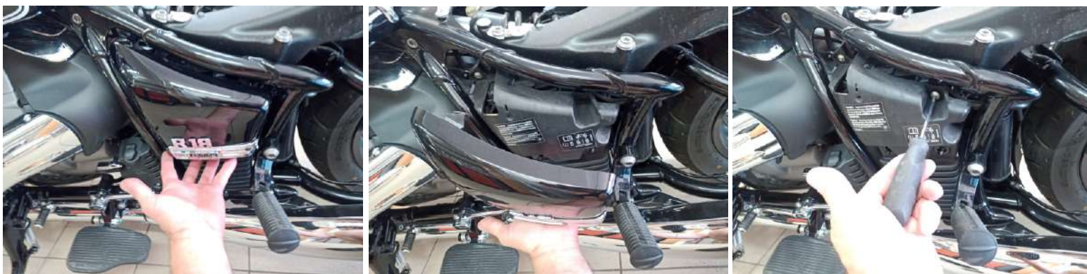
gently remove the left side cover then unscrew the three TORX screws