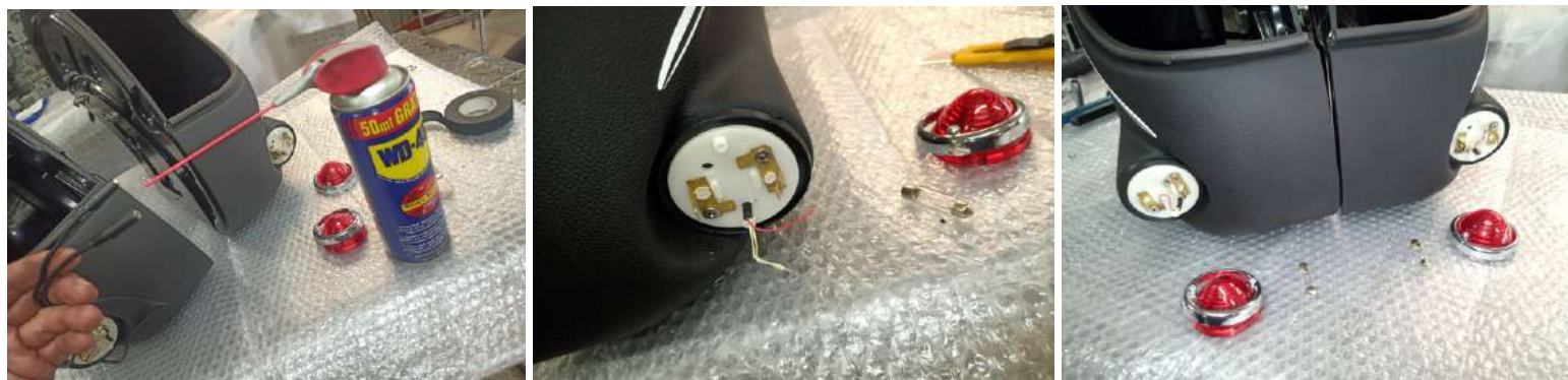
the contacts are slightly protected with Wd40 and weld cable contact , here is a three-core cable, two wires are minus (white and yellow), one wire (red) is a plus signal