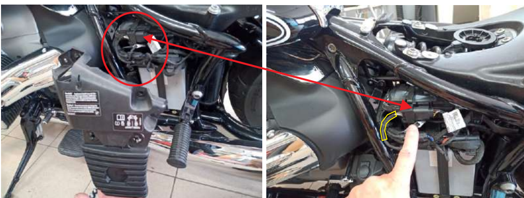
here we find a 6 pin connector , on the left side of the 6 pin connector remove the cotton isolation tape